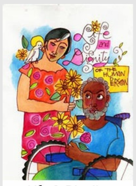
Life & Dignity of the Human Person